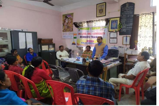
Pic 4 : SMC Meeting at PMSHRI Kalacherra HS School